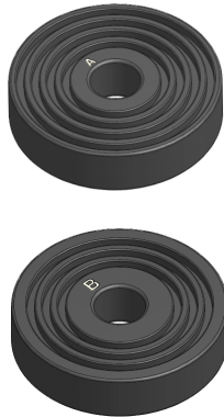
Side - B